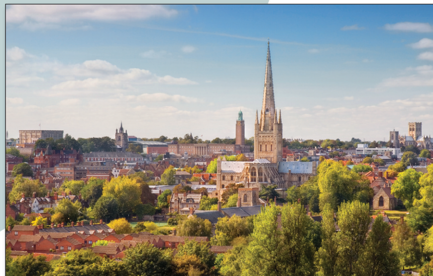
Norwich Cathedral in all its glory, amongst other famous Norwich landmarks