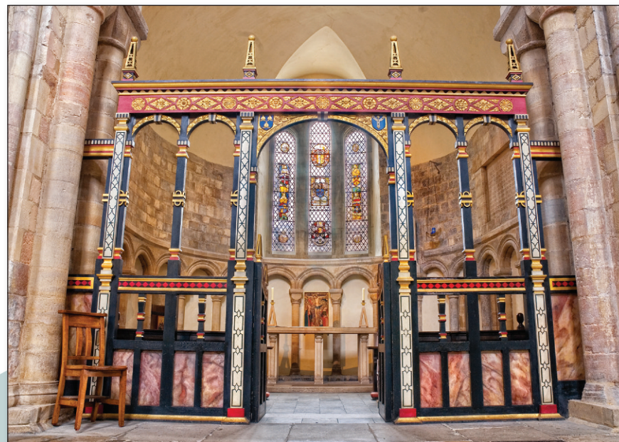
St Andrew's Chapel