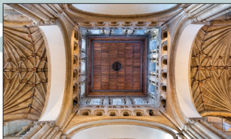
Looking up from The Crossing to the base of the Spire