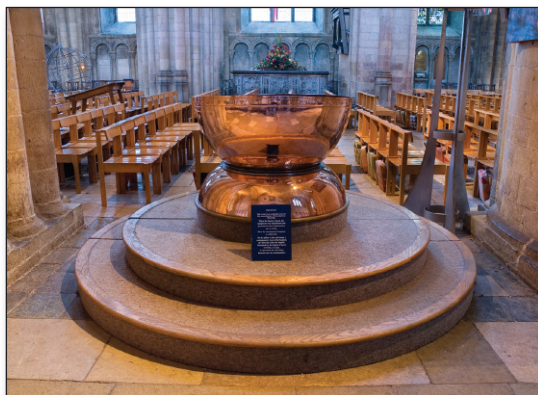
The Font, donated by the, now closed, Rowntree Chocolate Factory