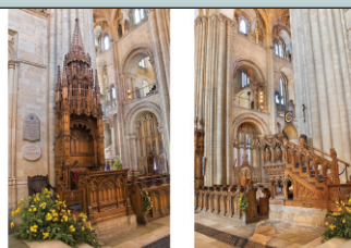
Left: An example of wood carving by master craftsmen