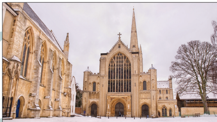
Right: Looking towards the West Front on a winter's day